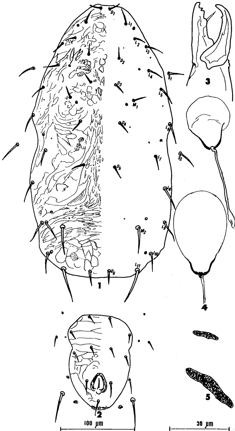
Figs. 1-5. Typhloctonus litoralis n.sp., female. 1. Dorsal shield. 2. Ventrianal shield. 3. Chelicera. 4. Spermathecae. 5. Metapodal plates.