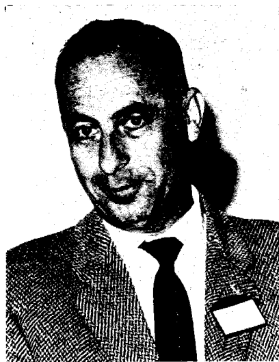
GIDEON COHEN 1917 – 1984

Gideon Cohen, formerly Head of the Department of Plant Protection and Inspection, and later Agricultural Counsellor at the Israeli Embassy, Washington, passed away on July 17, 1984.